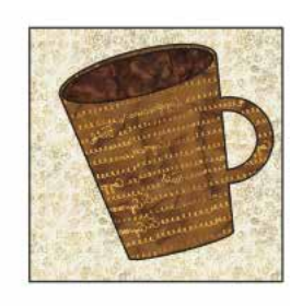
Make 2 each