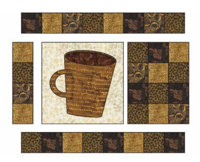
Placemat Assembly Diagram